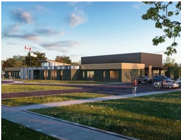
Architect's rendering of the new Beavercrest Community School

It seems that no matter where you go in Grey Highlands, there is building happening. In Dundalk, homes are popping up like mushrooms. The same can be said for Markdale, where a new subdivision is well under way and the new hospital construction is proceeding quickly. Locally on the educational scene, our board recently resubmitted through the 2022-23 Capital Priorities Program the replacement elementary school case for Dundalk. An 'Approval to Proceed' has also been submitted to the ministry for a scope change to increase the number of student spaces from 236 to 328 when building a replacement for Beavercrest Community School. We are hopeful that we will soon get approval to go ahead with these projects.